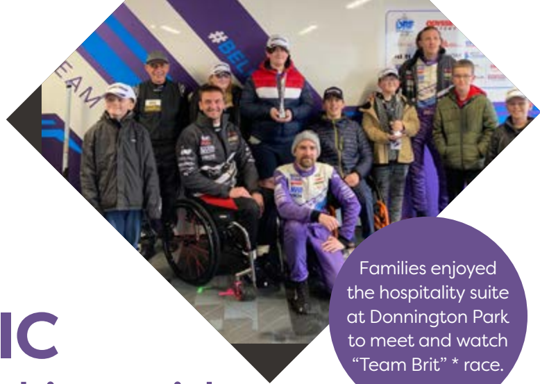
Families enjoyed the hospitality suite at Donnington Park to meet and watch "Team Brit" * race.