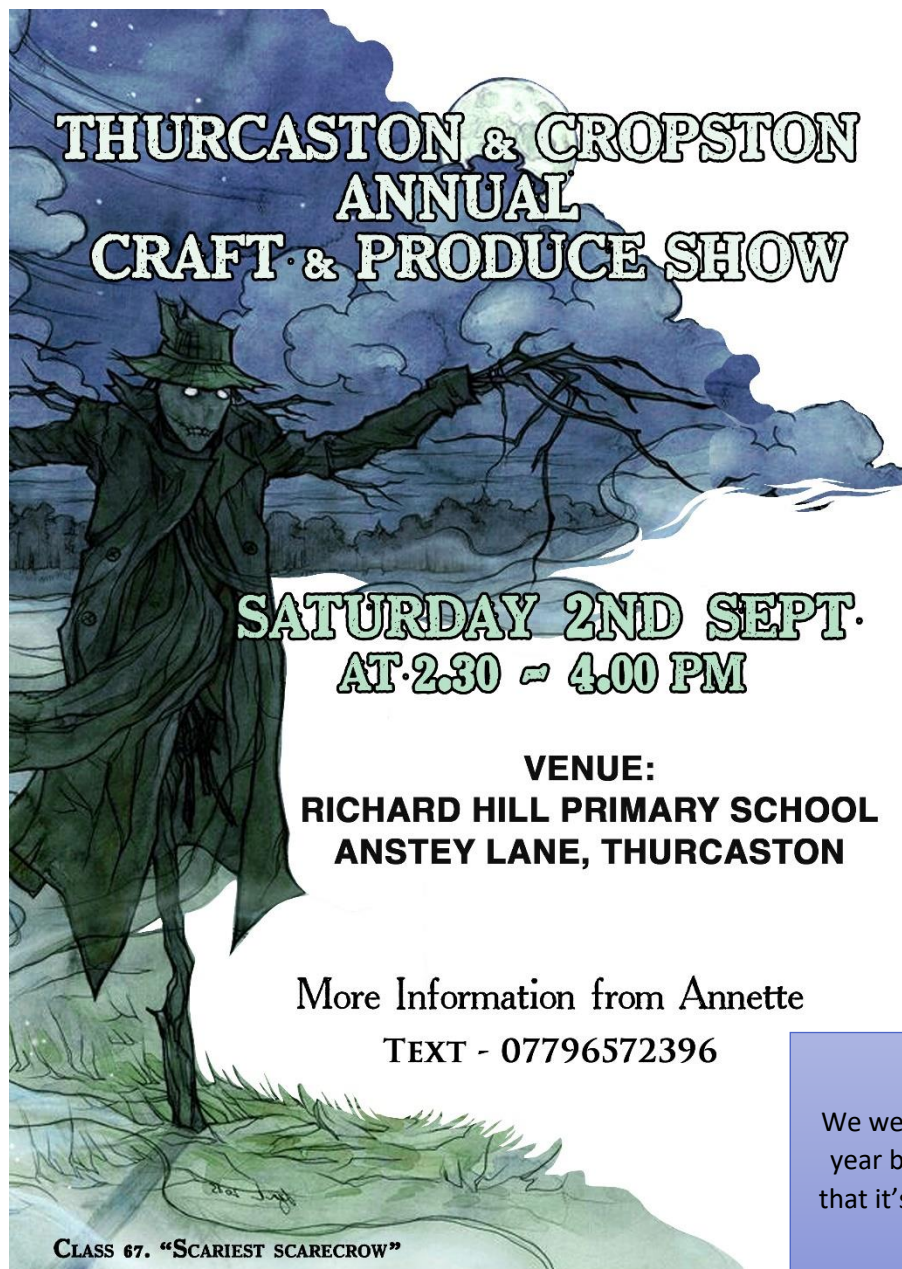
CLASS 67. "SCARIEST SCARECROW"